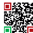
Identium elastic recovery video